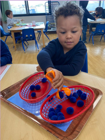
Tonging activity in Practical life- Tonging is an important activity to develop children’s hand and finger muscles which are responsible for cutting, grasping a pencil and writing. It also helps develop concentration and coordination.