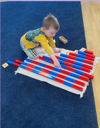
Number rods and cards- The children match the quantity to the symbols that they already know. The stair formation enables the child to understand the sequence of numbers.