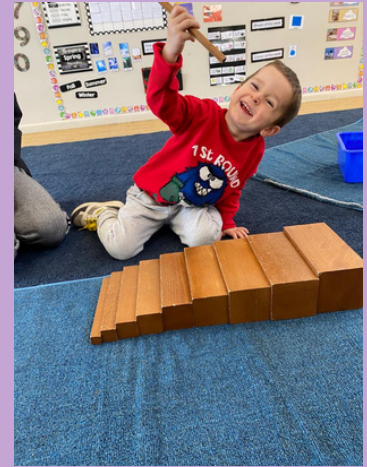
The brown stairs- This activity teaches spatial awareness, sequencing and fine and gross motor skills. The children are to sort the blocks in descending or ascending size order.