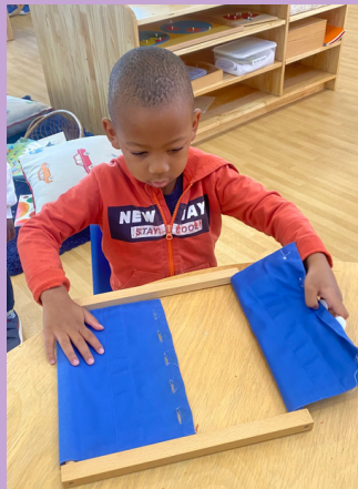
Large button frame- The child is practicing this self care activity. This activity helps build independence and concentration. It enhances focus, fine motor skills and hand eye coordination.