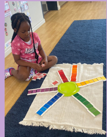
Colour box 3- The child arranges the mixed up color tablets in order from darkest to lightest. This activity develops the child’s ability to discriminate shades of color from dark to light.