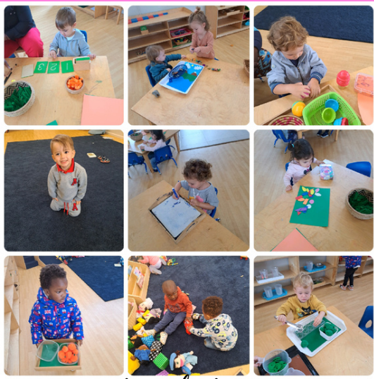
Exploring the classroom .