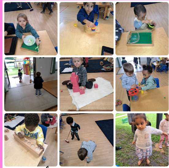
Sharing , creating and taking care of our environment .