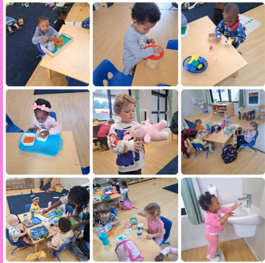
Developing skills .