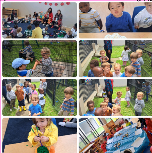
Enjoying birthdays and our time out and about